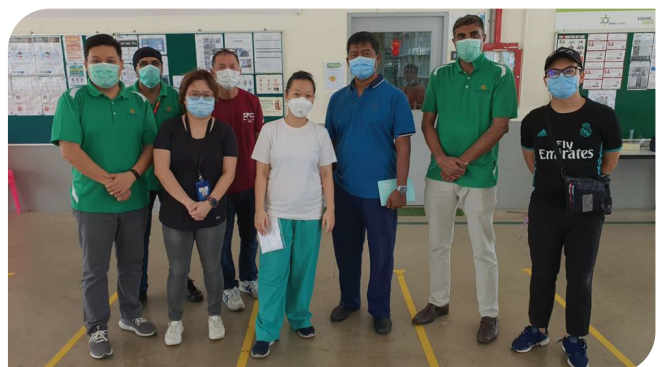
Employees wearing full protective suits and masks during safety training. Employees wearing masks and standing in a room with safety posters.